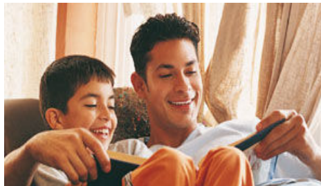
Dads make great reading partners